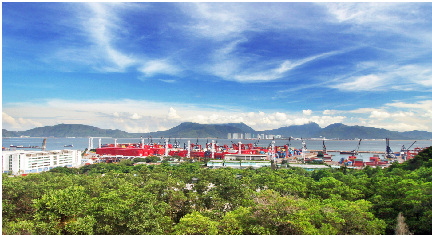
WITH MITIGATION MEASURE AT OPERATION DAY 1